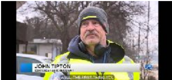
Cottage Line's - On scene Reporter